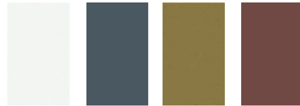
Duralloy® +PLUS Warm White Pearl Matt Duralloy® Storm Blue Matt Duratec® Eternity® Fine Gold Matt Duratec® Scoria Matt