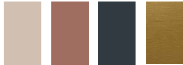
Castlepoint Pōhutu Geyser Karori Gold Vintage (Gold Effect)