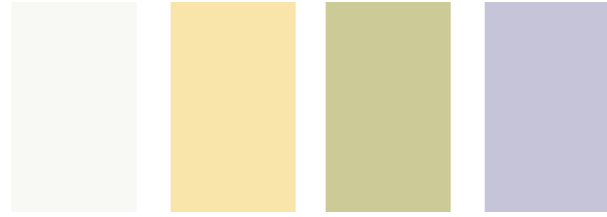
Southern Alps Hagley Park Mātauri Bay Tuakau