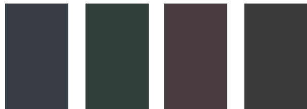
Peep-O-Day Finnegan Oboe D'Amore Wigram