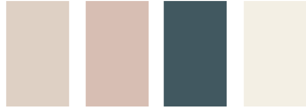
Whāngārā Basic Coral Browns Bay Sandfly Point Half