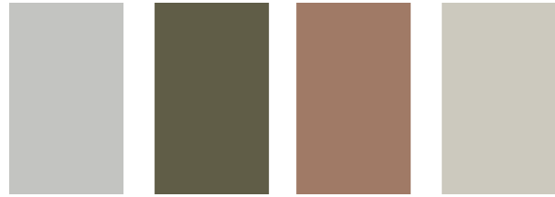
Millwater Natural Flora Lauder Narrow Neck Half