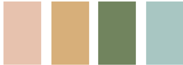
Titahi Bay Sandpaper Queenstown Hill Lakeside