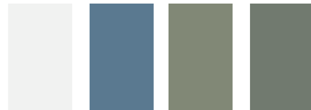
Duralloy® +PLUS Ōkārito Matt Duralloy® Wedgewood Matt Duralloy® +PLUS Mist Green Matt Duralloy® Bond Rivergum Matt