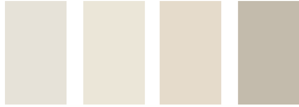
Ōpononi Quarter Duvauchelle Waiiau Bay Half Ōpononi Double