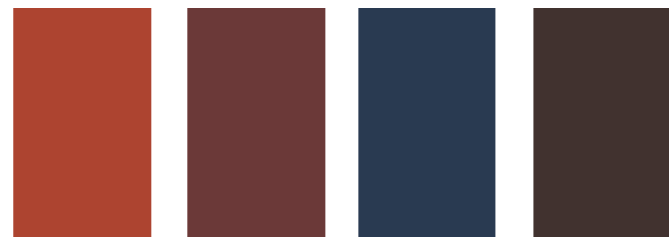
Coatesville Silo Park Kenepuru Deep Leather