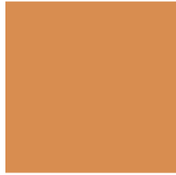
Dulux Matapouri A sandy ochre