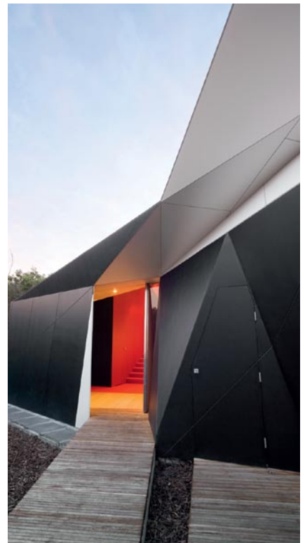
Klein Bottle House Winner 2008 Dulux Colour Award – Residential Exterior